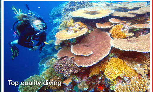
Top quality diving

Adventure Snorkel Safari - approximately 50 minutes Explore further via a dedicated snorkel tender. Drift snorkel one of the spectacular Reef Magic Walls famous for their extensive coral formations and HUGE schools of fish!