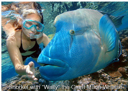
Snorkel with "Wally" the Giant Maori Wrasse