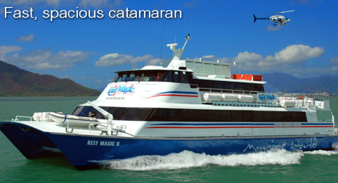
Fast, spacious catamaran