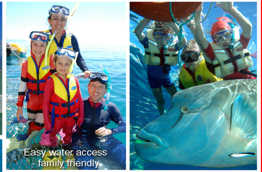
Easy water access - family friendly